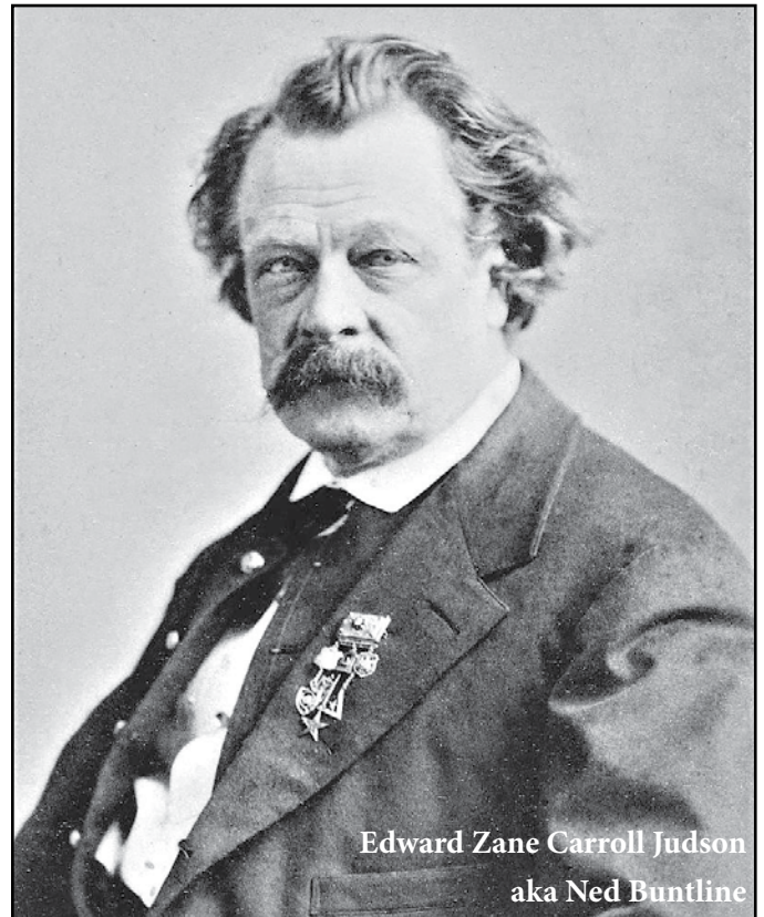
Edward Zane Carroll Judson aka Ned Buntline

Spanish explorer Juan Ponce de Leon landed on April 2, 1513, reportedly near the mouth of the St. Johns River, although historians for years have disputed the exact location. Two other possible landing sites have been suggested – Ponce Inlet near today's Daytona Beach and, even farther south, Melbourne Beach. He named this land La Florida , after Pascua Florida , the Easter season festival of flowers.