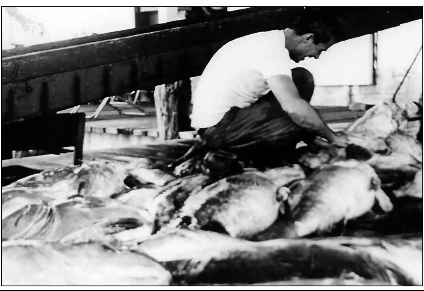
The St. Lucie Historical Society, Inc.